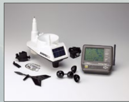
6250 Vantage Vue