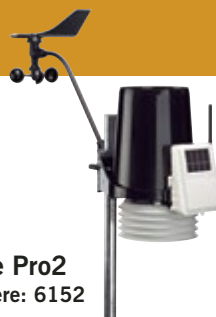
Vantage Pro2 Shown here: 6152