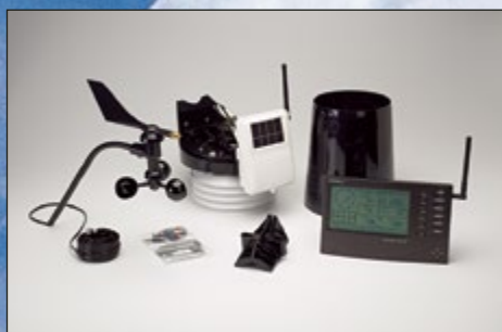
6152 Wireless Vantage Pro2. Now includes built-in bubble level for more accurate installation. The aluminum-plated tipping bucket in our rain collector is self-emptying, corrosion resistant and laser calibrated for exceptional accuracy.