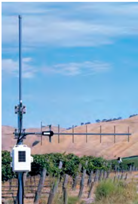
Long-range repeater with one Yagi and one Omni antenna.