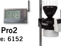
Vantage Pro2 Shown here: 6152