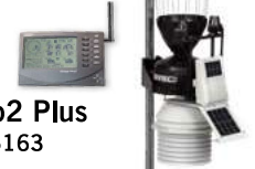
Vantage Pro2 Plus Shown here: 6163