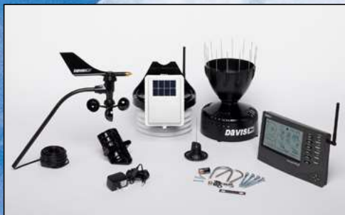
6152 Wireless Vantage Pro2. Includes built-in bubble level for more accurate installation. The aluminum-plated tipping bucket in our rain collector is self-emptying, corrosion resistant and laser calibrated for exceptional accuracy.

Access real-time data anywhere at any time with WeatherLink.com and the WeatherLink Mobile App . See page 15 for details.