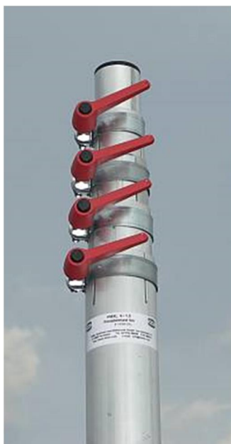
PM6XL/1.5 mast with 4 quick release clamps

Usually these masts require a flat or socket wrench, with the quick release clamps you can raise and lower the masts without any tools.