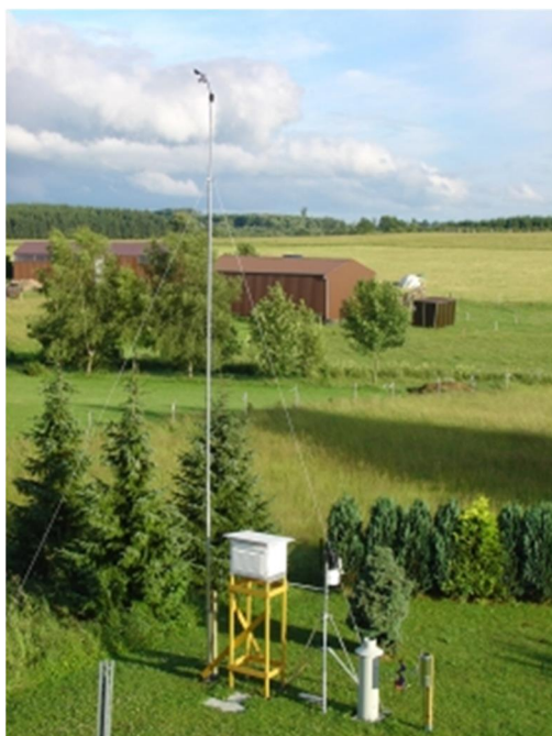
Example of a 9m aluminum mast with a wind measurement instrument.

The telescopic masts are manufactured from sideways slotted aluminum tubes. The mast can be extended to any length and securely locked into place by means of a massive clamp. The maximum allowed extended length is marked by a color ring approx. 20cm before the end of each tube. There is no fixed stop which makes it advisable to approach the marking slowly when extending the telescopes.