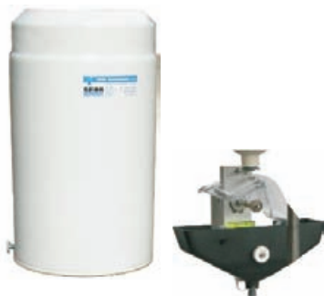
Tipping Bucket System

For the installation in areas with a risk of frost, the rain gauge can optionally be equipped with a funnel heating system.