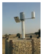
Groundwater Station with RG50