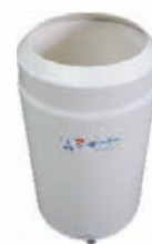
Rain Gauge RG 50