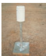
RG-50 with metal stand