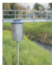
TRW Rain Station