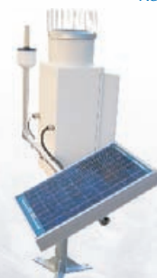
Telemetric Rain Gauge RG100 with IRIDIUM-Satellite Transmission