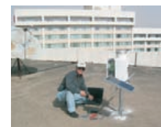
Installation of RG-100 on roof top