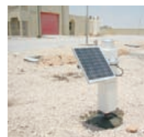
Telemetric Rain Gauge Station