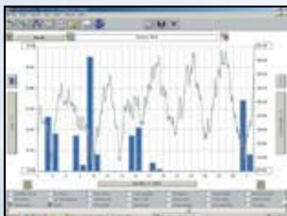
View multiple weather variables at the same time to see their relationships.